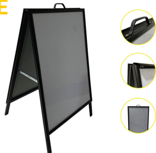
SNAP A-FRAME HARDWARE